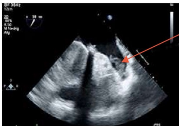
Blood clot in the left atrial appendage

Persons with atrial fibrillation have an increased risk of suffering blood clots from the heart to the brain. 25% of all blood clots in the brain are caused by blood clots forming in the heart during atrial fibrillation, tearing away and travelling to the brain via the blood stream. By far the majority of blood clots are formed in a small "appendix" to the left atrium – the auricula.